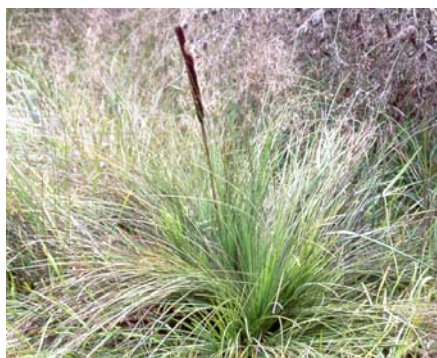
Xanthorrhoea bracteata . S. Wood.