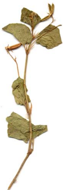
Viola caleyana . Tasmanian Herbarium specimen.