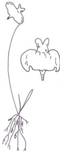
Utricularia violacea . Drawing: E. Lazarus