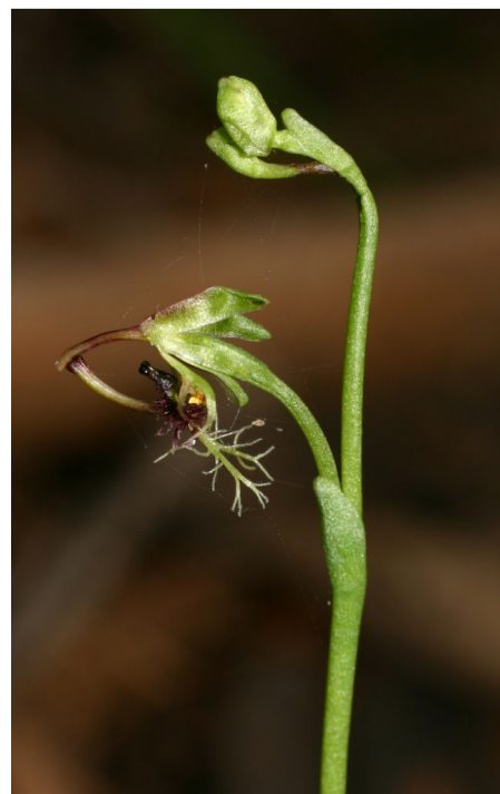
Plate 1. Thynninorchis huntiana flower from Wilsons Promontory in Victoria