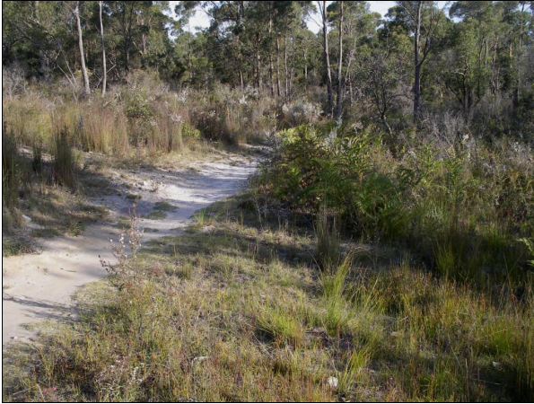
Plate 2. Thelymitra atronitida habitat near Kingston

In Tasmania Thelymitra atronitida has been recorded from near-coastal heathland, sedgeland and open heathy/sedgey eucalypt woodland on relatively poorly-drained sandy loams (Plate 2). The altitude range of known sites is 10 to 120 m above sea level.