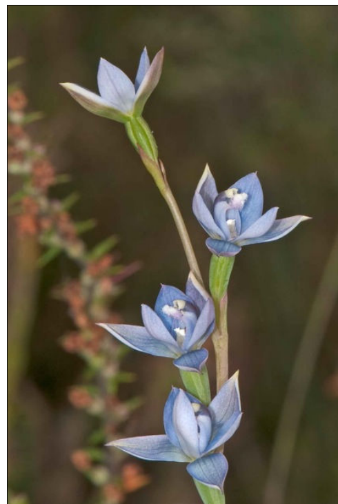
Plate 1. Thelymitra atronitida