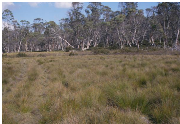
An example of the Highland grassy sedgeland community, Lake Olive Track. Sib Corbett.

This community can be seen near the Vale of Belvoir and Lake Olive in the north-west; Interlaken and Liawenee Moor on the Central Plateau.