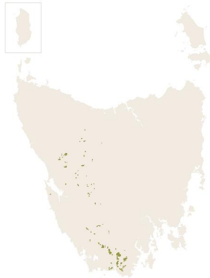
Indicative Athrotaxis selaginoides subalpine scrub distribution from TNVC 2014