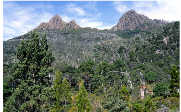
An example of the Athrotaxis selaginoides subalpine scrub community at Cradle Mountain.

To help you decide if this Threatened Native Vegetation Community is on your site, a decision tree is provided further below. This is a guide only. Assessment by a qualified ecologist is needed to confirm the presence (or absence) of a listed threatened community.