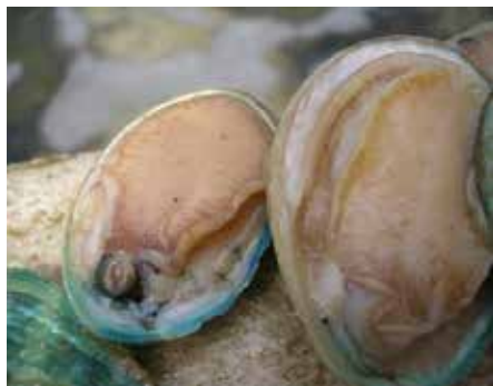
Greenlip abalone showing the symptoms of AVG