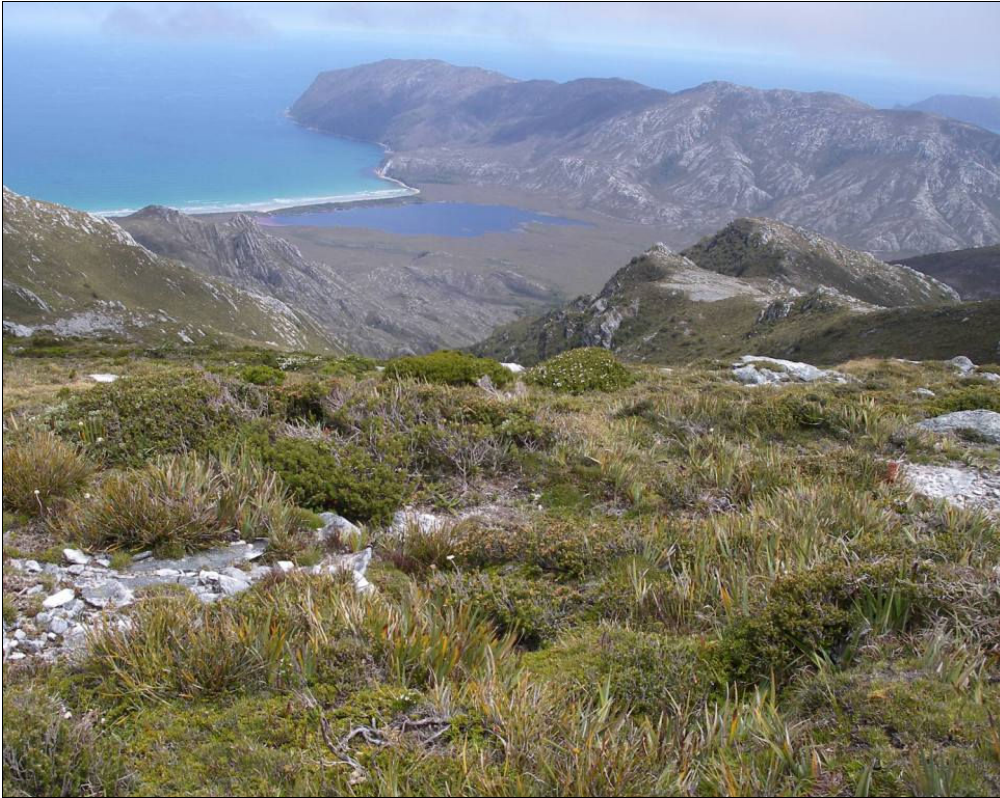
Plate 1. Persoonia moscalii habitat on the southern slopes of Mt Counsel