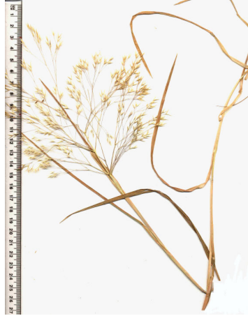
Lachnagrostis billardierei subsp. tenuiseta . Tasmanian Herbarium specimen.