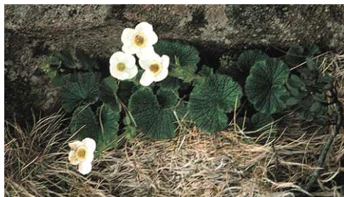
Geum talbotianum . Plant Science Dept. University of Tasmania.