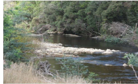
Photo of the Ringarooma River at Branhholm