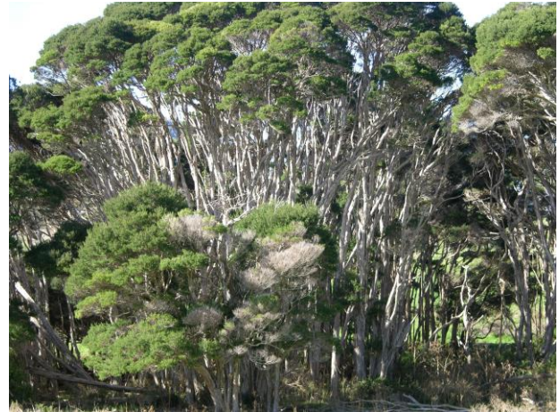
An example of the Melaleuca ericifolia swamp forest community near Stanley. Micah Visoiu.

To help you decide if this Threatened Native Vegetation Community is on your site, a decision tree is provided further below. This is a guide only. Assessment by a qualified ecologist is needed to confirm the presence (or absence) of a listed threatened community.