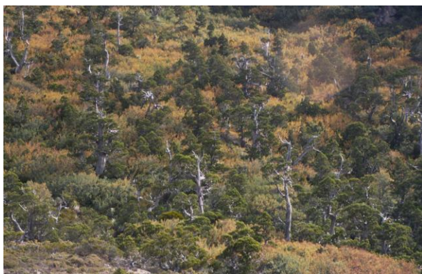
An example of the Athrotaxis cupressoides / Nothofagus gunnii short rainforest community Mount Field National Park. Keith Corbett.

This is dense closed montane short forest and scrub in which Athrotaxis cupressoides (pencil pine) is dominant above a tangle of Nothofagus gunnii (deciduous beech). The community may consist predominantly of these two species or be more diverse, with Diselma archeri (dwarf pine) and various species of Richea (candleheath) and other shrubs present. The canopy is usually between 8-15 m in height, but emergent Athrotaxis cupressoides can reach up to 20 m. The community mainly occurs on fire-protected sites between 750 and 1400 m above sea level, generally on dolerite. It is distinguished from other vegetation dominated by A. cupressoides by the abundance of Nothofagus gunnii , which dominates the understorey and/or is present in the canopy. Where patches of A. cupressoides occur within stands of tall N. gunnii overtopped by Athrotaxis selaginoides (king billy pine) on the West Coast Range, they are included within 6 Athrotaxis selaginoides / Nothofagus gunnii short rainforest.