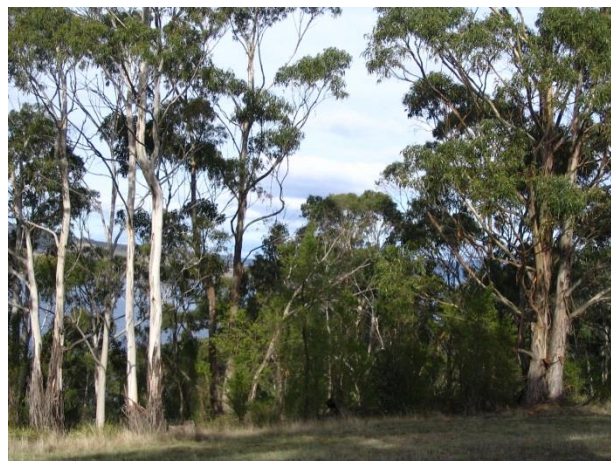
An example of the Eucalyptus viminalis – Eucalyptus globulus coastal forest and woodland community at Tinderbox, Nepelle Temby.

To help you decide if this Threatened Native Vegetation Community is on your site, a decision tree is provided further below. This is a guide only. Assessment by a qualified ecologist is needed to confirm the presence (or absence) of a listed threatened community.