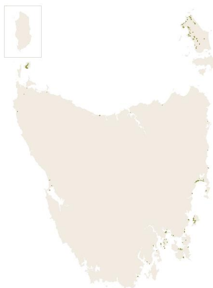
Indicative Eucalyptus viminalis – Eucalyptus globulus coastal forest and woodland distribution from TNVC 2014