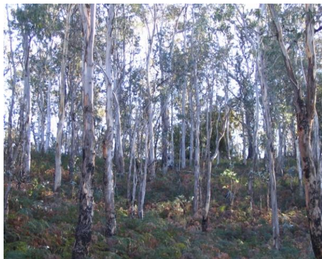
An example of the Eucalyptus tenuiramis forest and woodland on sediments community at Brown Mountain, Campania. Nepelle Temby.

To help you decide if this Threatened Native Vegetation Community is on your site, a decision tree is provided further below. This is a guide only. Assessment by a qualified ecologist is needed to confirm the presence (or absence) of a listed threatened community.